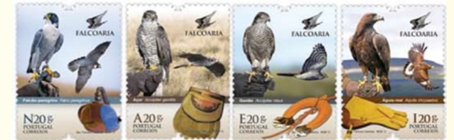
A series of wonderful stamps published in Portugal this year

The first is our commitment to the pursuit of the recognition of Portuguese Falconry has Cultural Heritage by the UNESCO. A very important and actual proof of our cultural attachment to falconry was the recent creation of a Philatelic Emission about falconry by our national mail company. This moment was beautiful and we have great pride in the stamps that were printed (photos above right). We hope you enjoy them as much as we! For the goal of submitting to UNESCO have signed a protocol with the Portuguese University of Evora to help us with the process and with a tow in which falconry traditions go deep since the XVII Century: Salvaterra